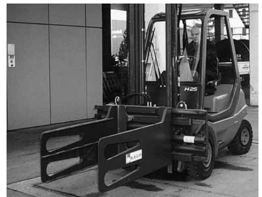
Fig. 3: Bale clamp. Always use the correct load handling attachment.