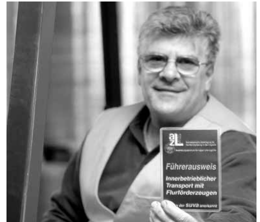
Fig. 1: Any person who drives a forklift truck must be trained. A list of FLT driving schools can be found at www.suva.ch/stapler .