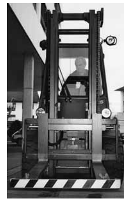
Fig. 5: If a forklift is operated on public roads, it must be equipped in accordance with the rules of the road traffic regulations.