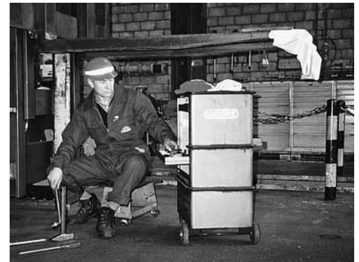
Fig. 6: When maintenance work is carried out under the fork, the fork must be supported, and the elevated fork position indicated by suitable warning signs.